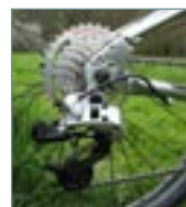
(Above) Correctly sized cranks! (Below) An 11-34T 8-speed cassette gives a wide, user-friendly gear range