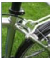
(Above) The Sora shifter is reach-adjusted, and there are auxiliary brake levers too (Below) Frame fittings for a (scaled down) rear carrier

more importantly, children are very much lighter than adults.